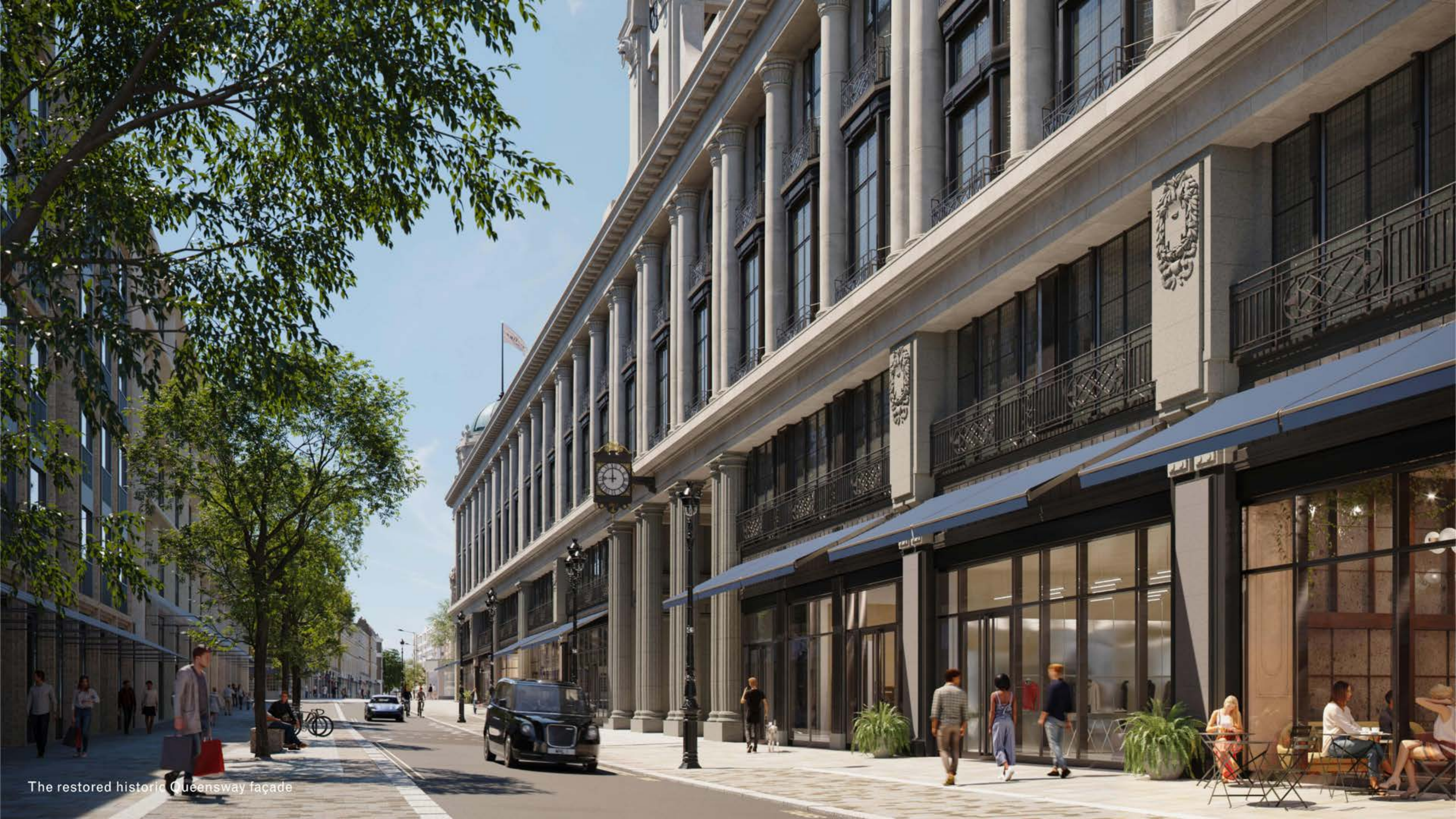
The restored historic Queensway façade