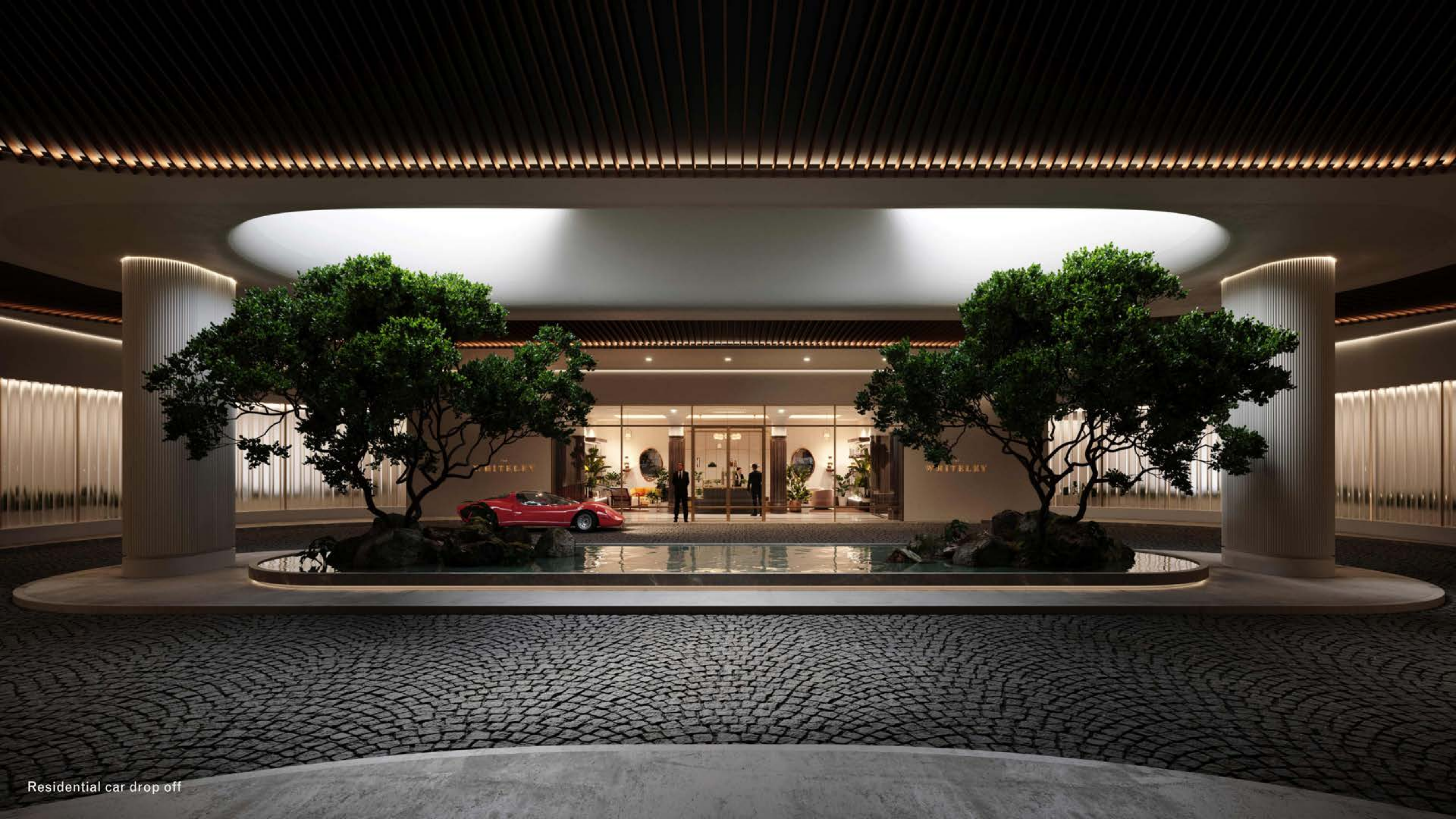
Residential car drop off