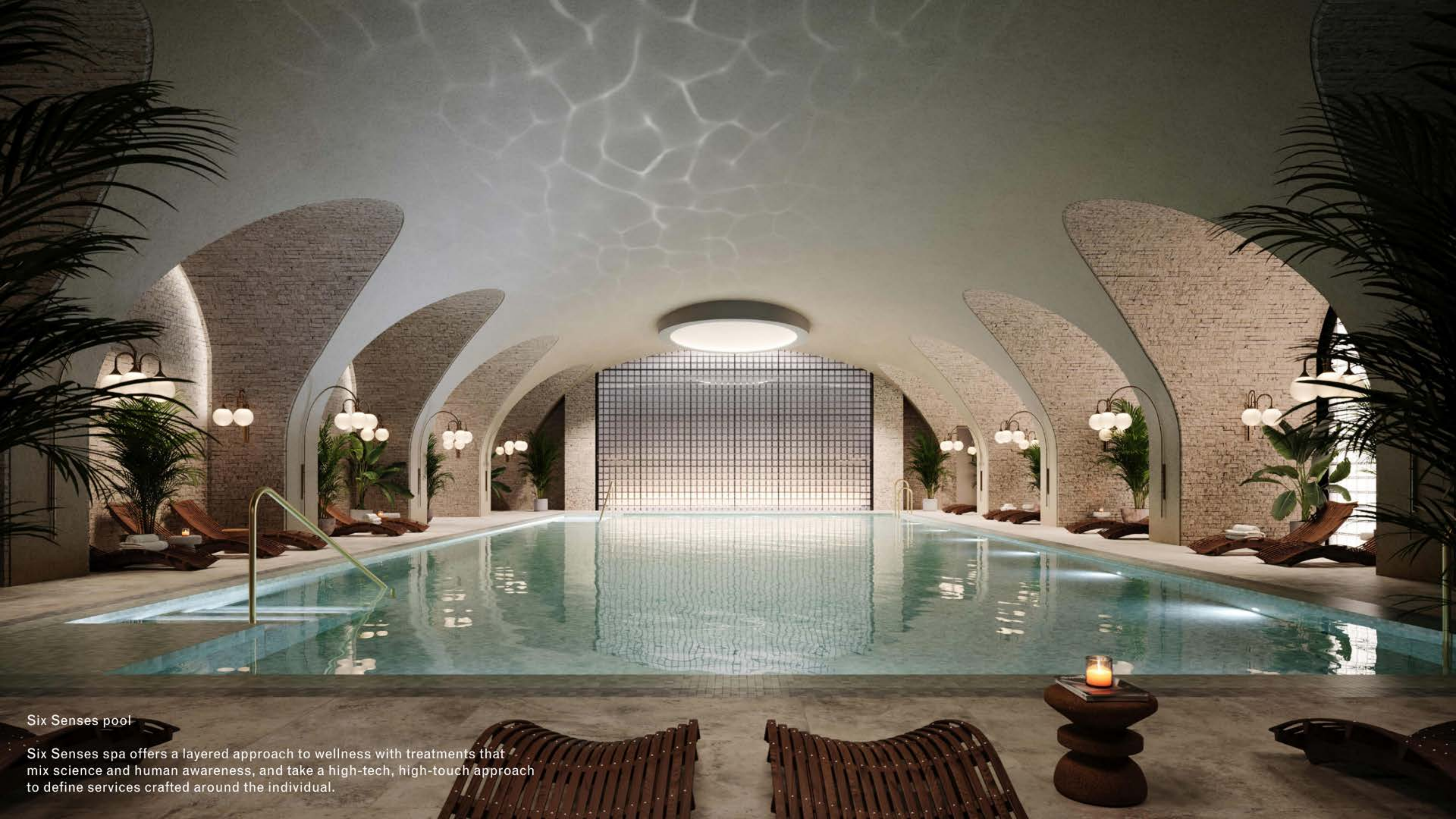
Six Senses pool

Six Senses spa offers a layered approach to wellness with treatments that mix science and human awareness, and take a high-tech, high-touch approach to define services crafted around the individual.