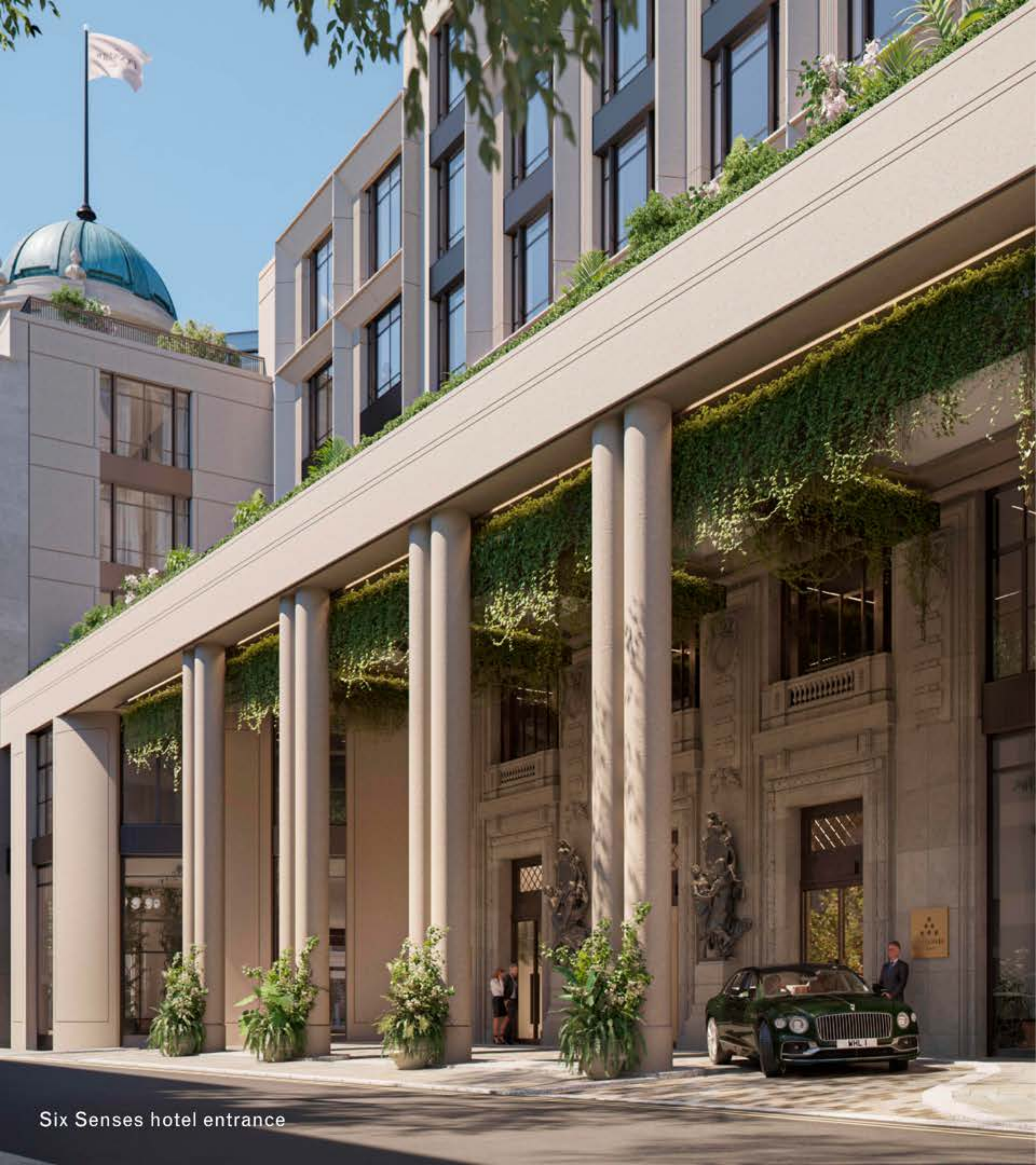
Six Senses hotel entrance